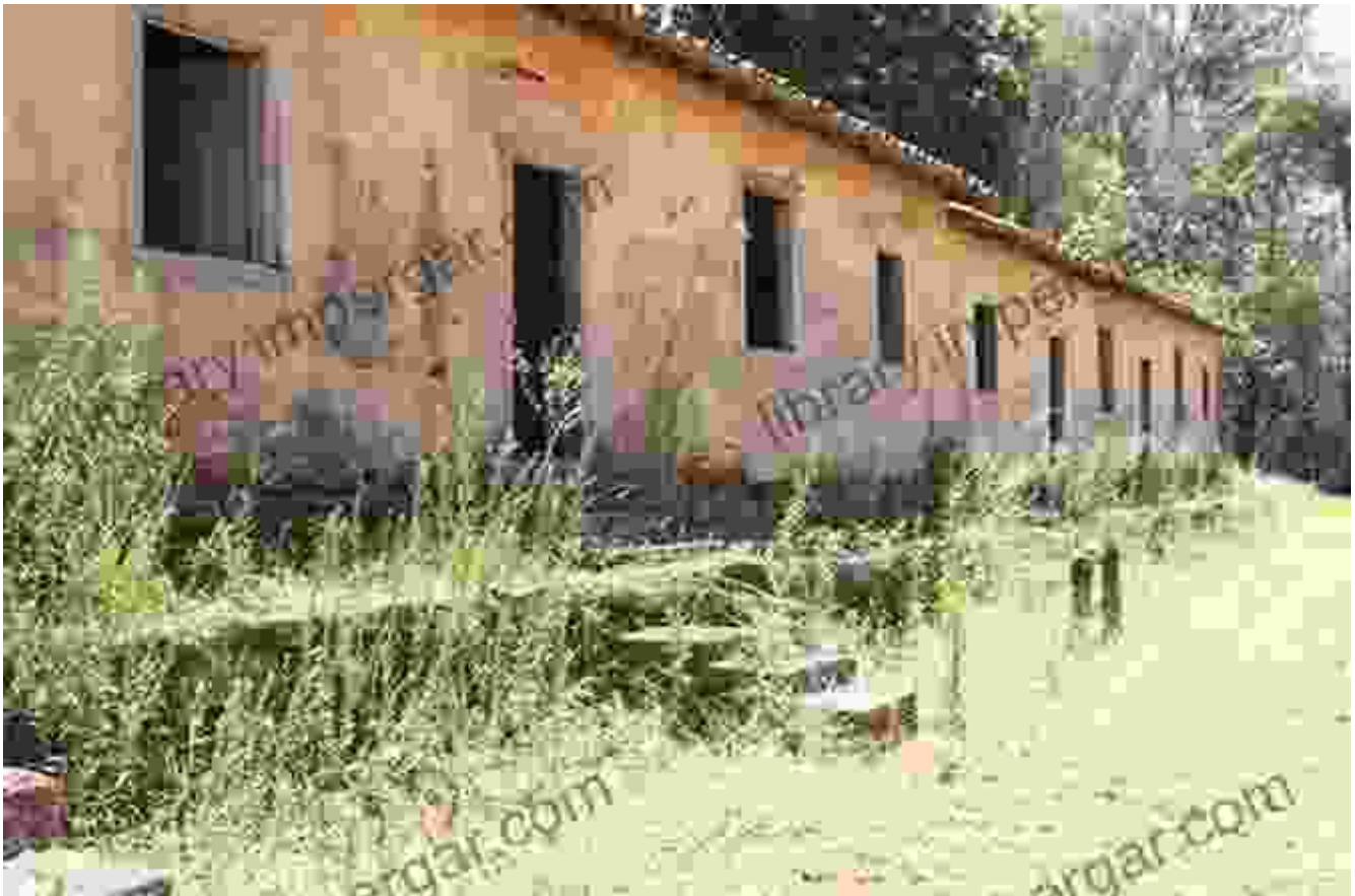
The Slave Quarters

In stark contrast to the grandeur of the manor house, the inventory also sheds light on the lives of the enslaved Africans who labored on the coffee plantation. The slave quarters, a collection of simple and humble dwellings, tell a poignant tale of the social inequality that pervaded Brazilian society. Through the inventory, we gain insights into the living conditions, daily routines, and cultural practices of these marginalized individuals.