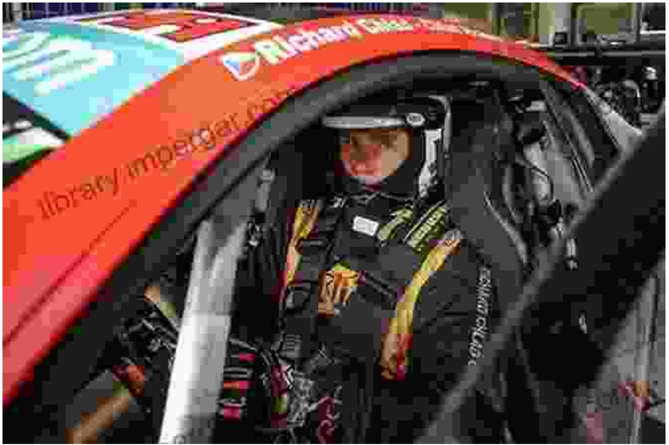
Close-up shot capturing the intensity of the driver's emotions.