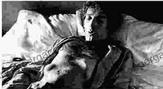
The Presence of Norman O. Brown in the Work of David Cronenberg