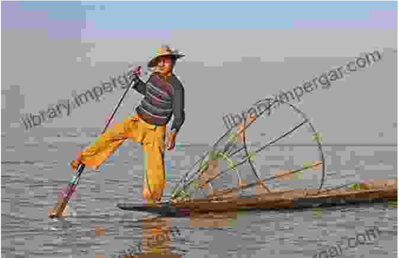
Intha fishermen navigating the waters of Inle Lake